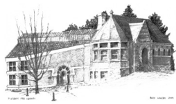
PILLSBURY FREE LIBRARY Warner, New Hampshire