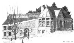
PILLSBURY FREE LIBRARY Warner, New Hampshire